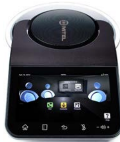
MiVOICE CONFERENCE PHONE