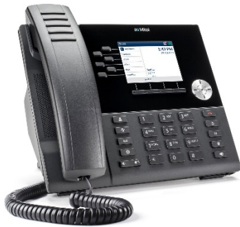
MiVOICE 6920 IP PHONE