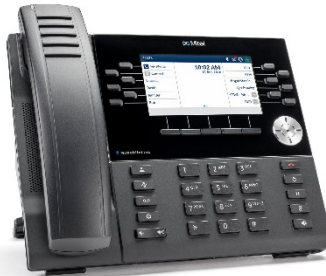
MiVOICE 6930 IP PHONE