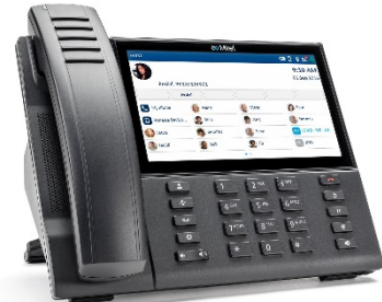
MiVOICE 6940 IP PHONE