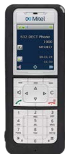
Mitel 600 Series Dect Phones